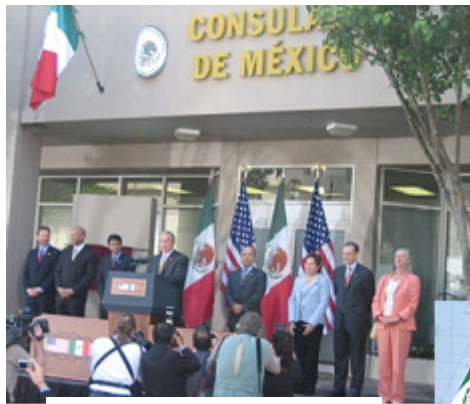
North American Leaders' Summit – Mexico - 2005